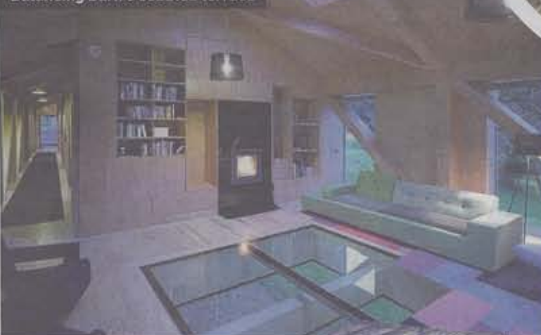
A disguised trap door leads to the Balancing Barn's cobbled terrace

"THE BUILDERS ATE A WHOLE COW BETWEEN OCTOBER AND APRIL. BUT THAT'S THE BEAUTY OF BEING A FARMER"