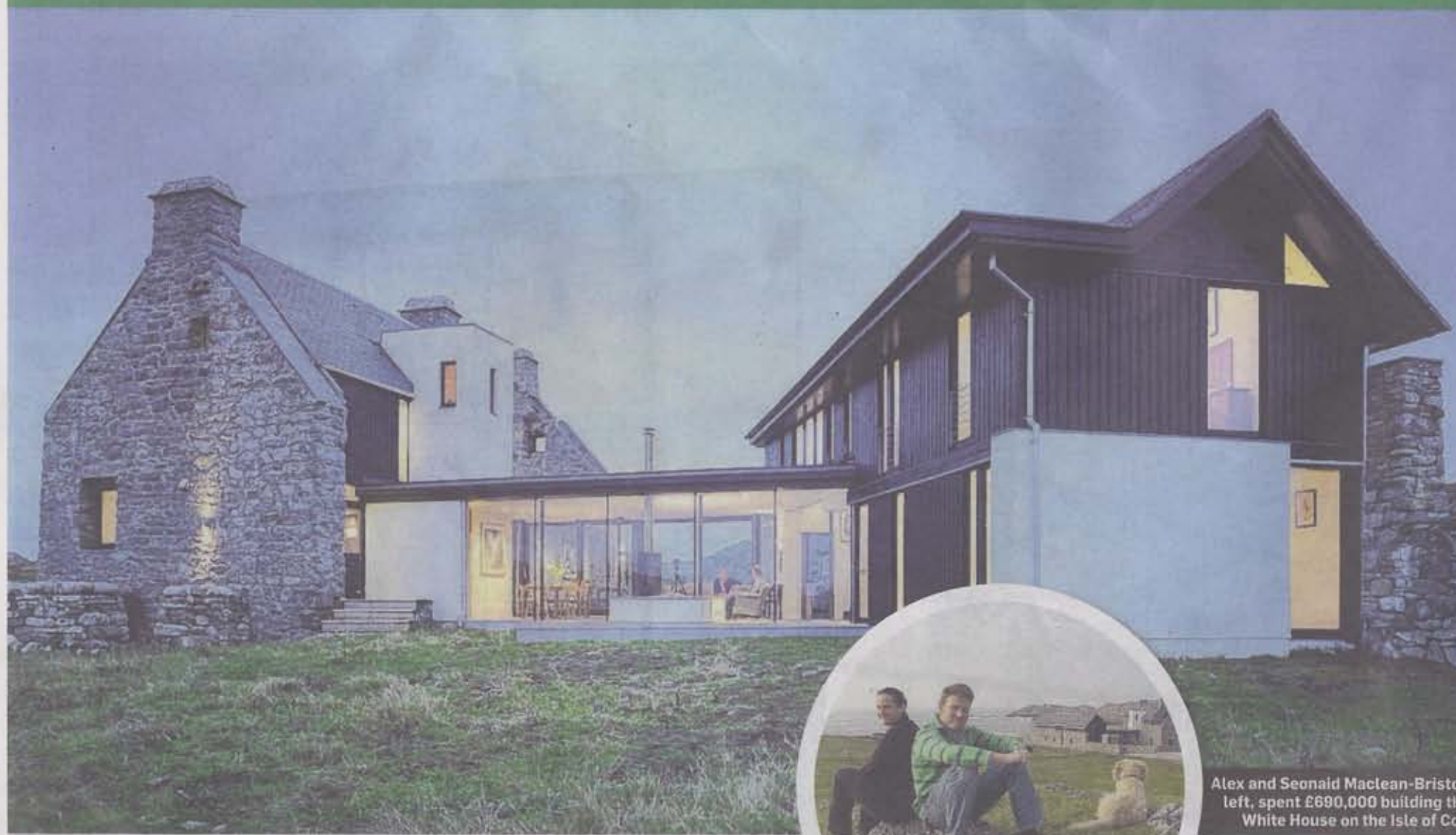
Alex and Seonaid Maclean-Bristol, left, spent £690,000 building the White House on the Isle of Coll

SLIDING DOORS RUN THE LENGTH OF THE GROUND FLOOR AND OPEN ALL THE WAY, CREATING A BREEZE, BUT ALSO, SLIGHTLY DISCONCERTINGLY, ALLOWING IN THE OCCASIONAL BIRD