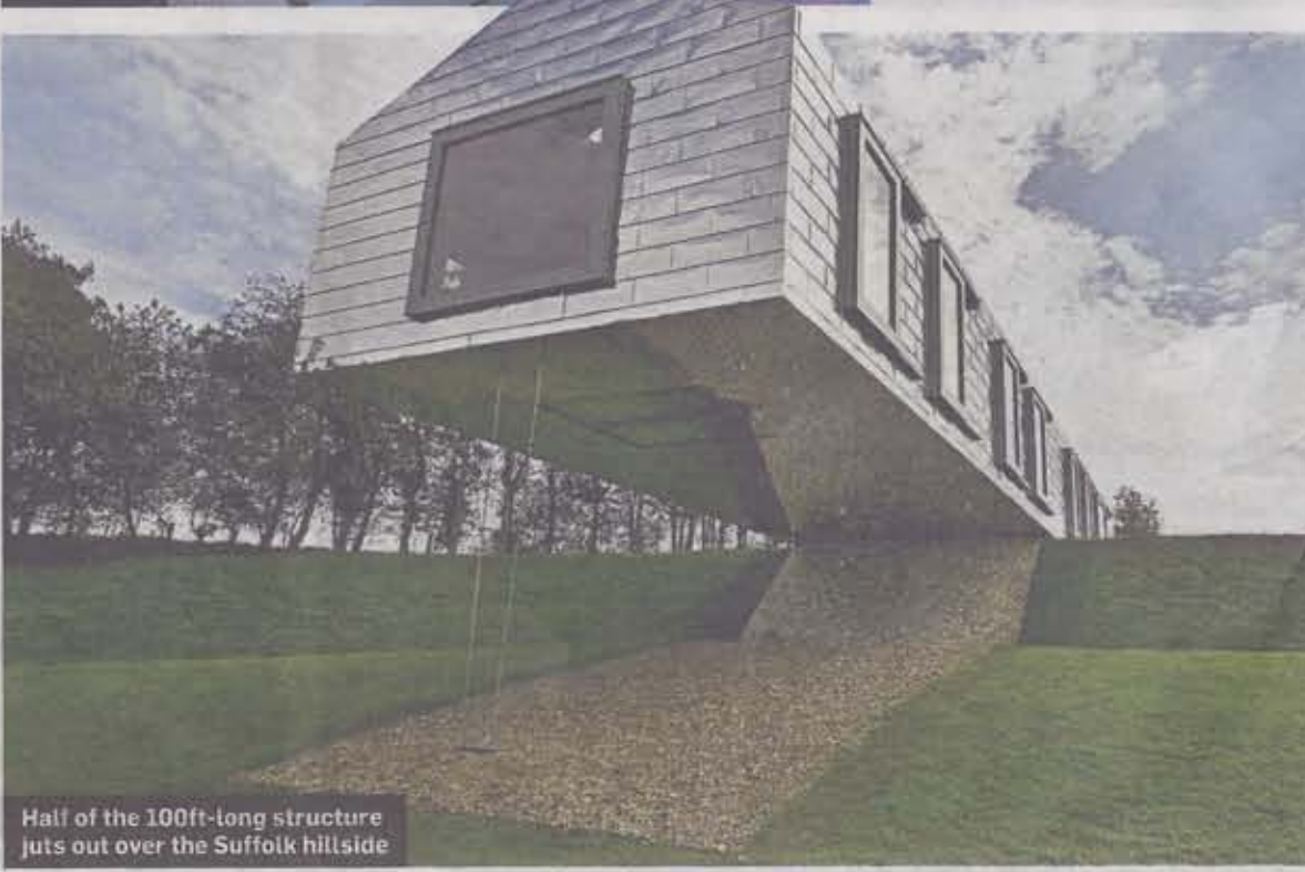
Half of the 100ft-long structure juts out over the Suffolk hillside

"THE BUILDERS ATE A WHOLE COW BETWEEN OCTOBER AND APRIL. BUT THAT'S THE BEAUTY OF BEING A FARMER"